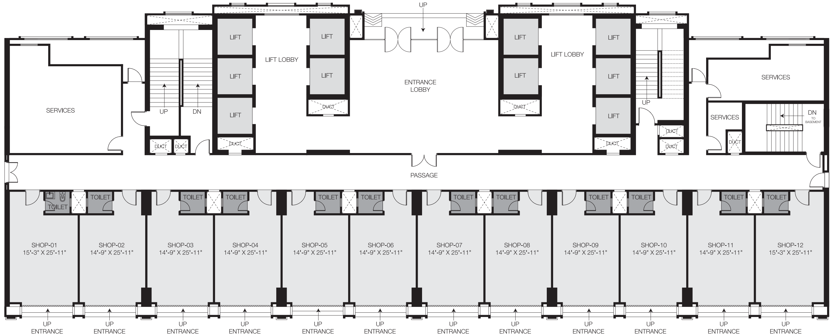
Carpet Area Statement