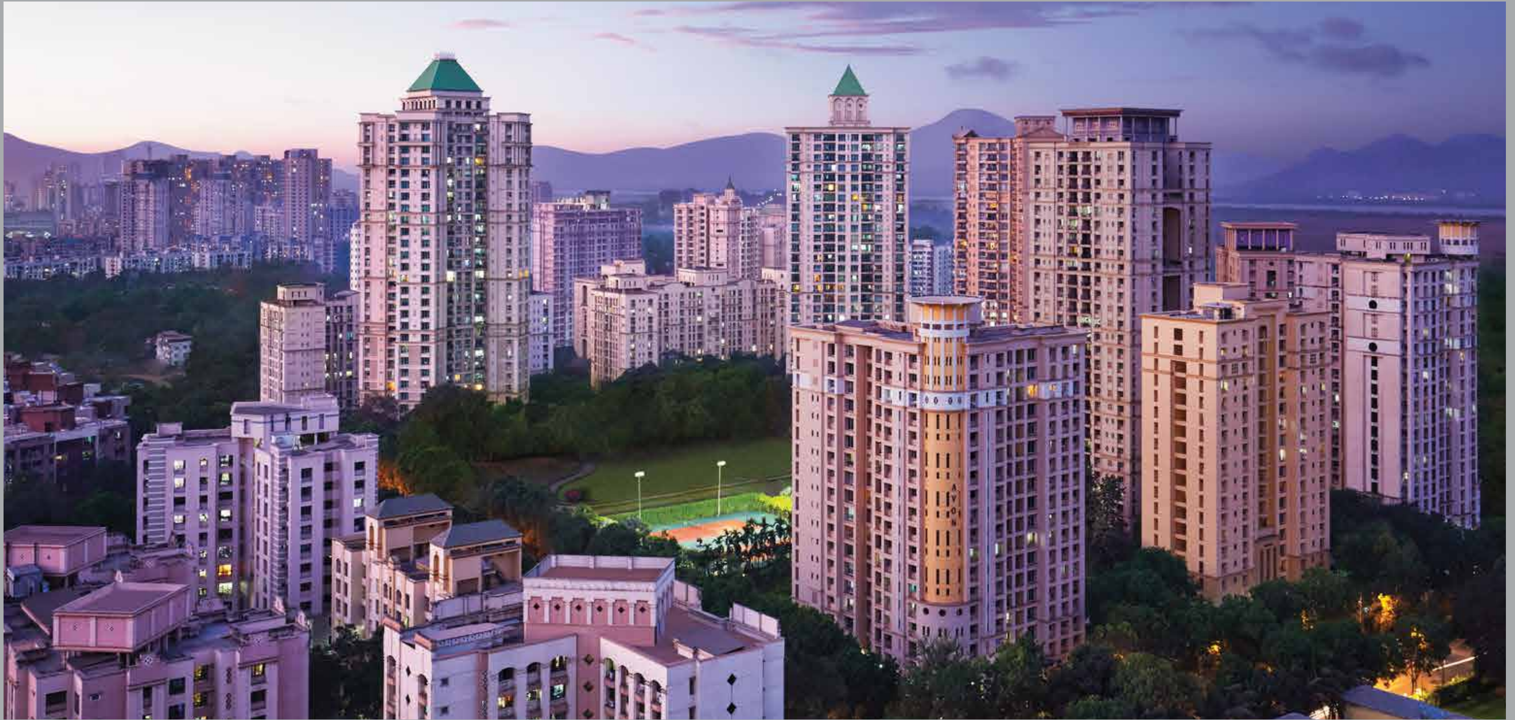
Actual image of Hiranandani Estate, Thane

Hiranandani Estate, Benchmarking community living in Thane.