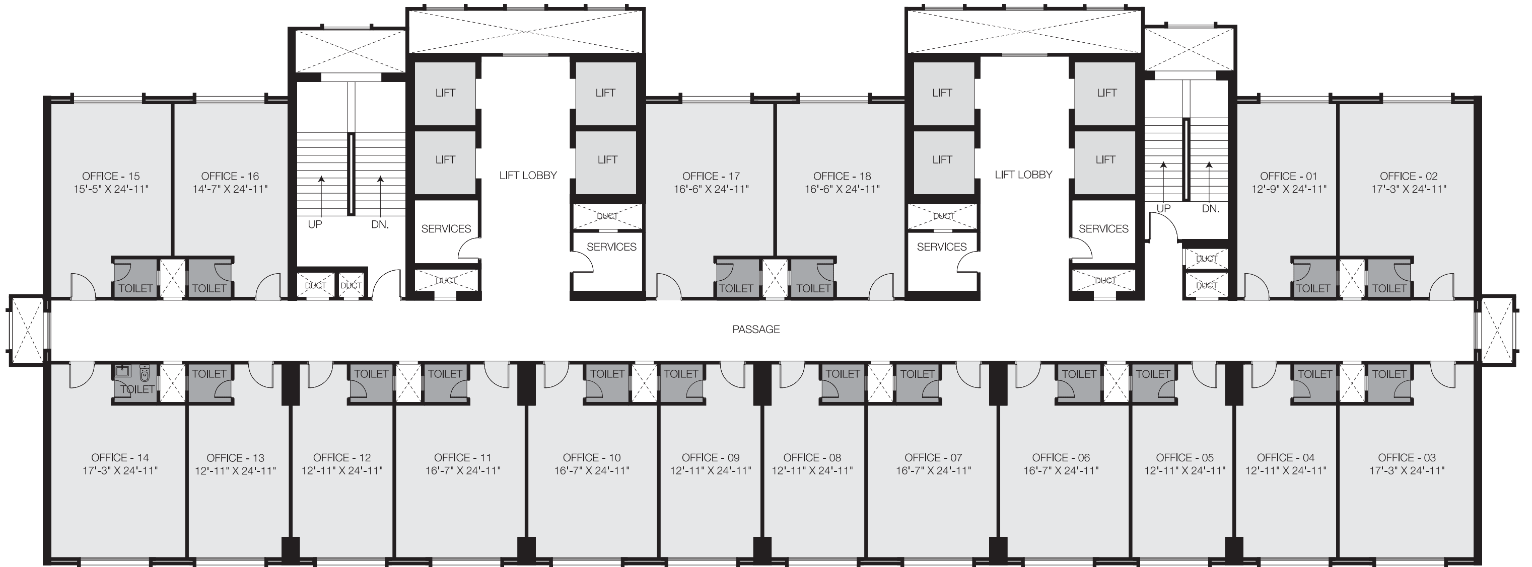
Carpet Area Statement