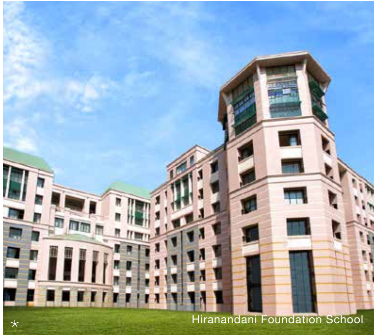
Hiranandani Foundation School