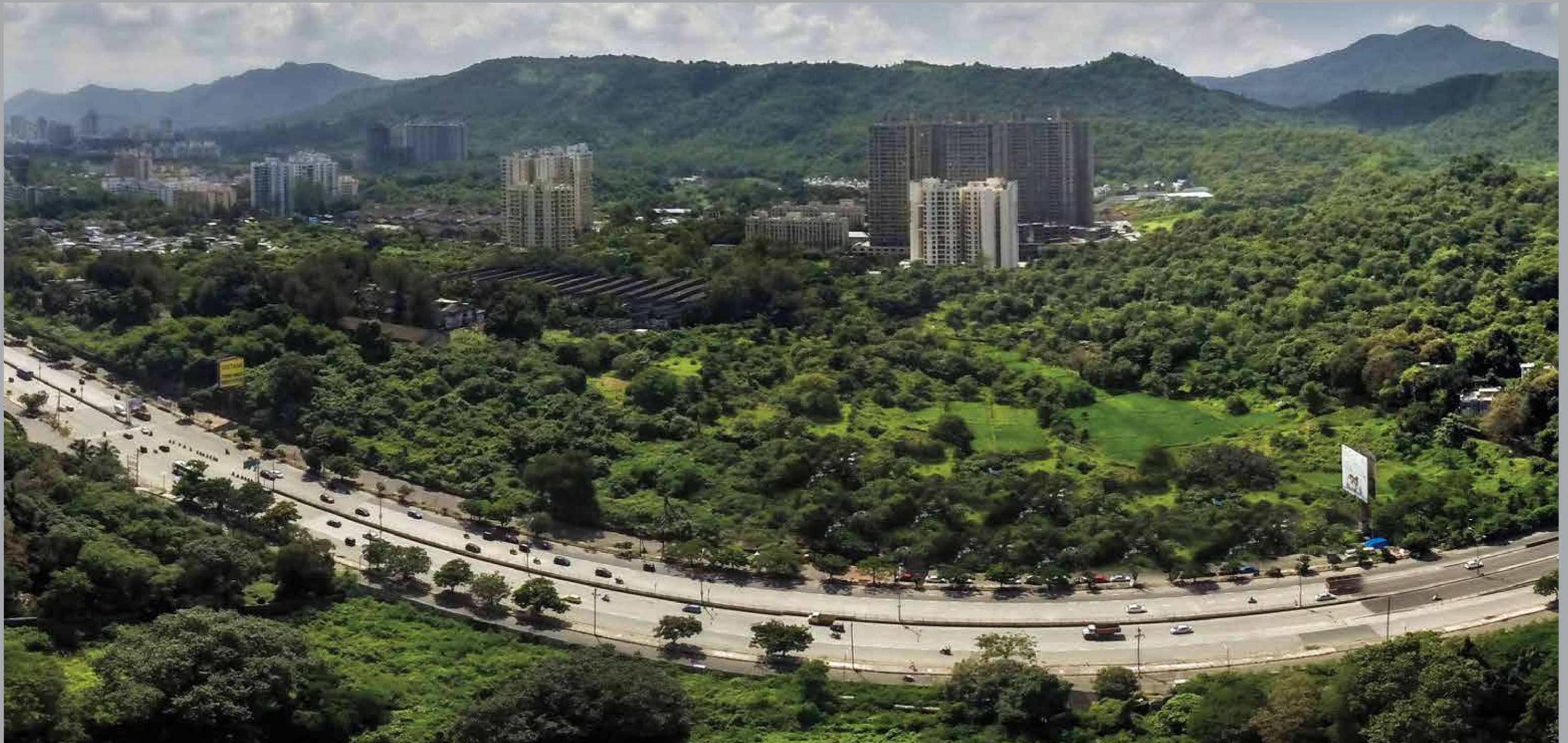
Actual image of Ghodbunder Road, Thane

In today's fast-paced world, it is eminent to make optimum utilisation of time. Therefore, one has to wisely choose the destination for their business. Being settled in Thane, Solus enjoys a plethora of location advantages. It offers supreme level of convenience as all essentials are within the vicinity.