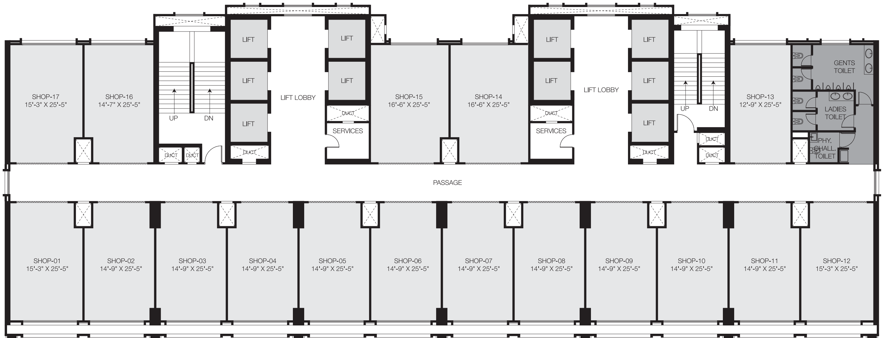
Carpet Area Statement