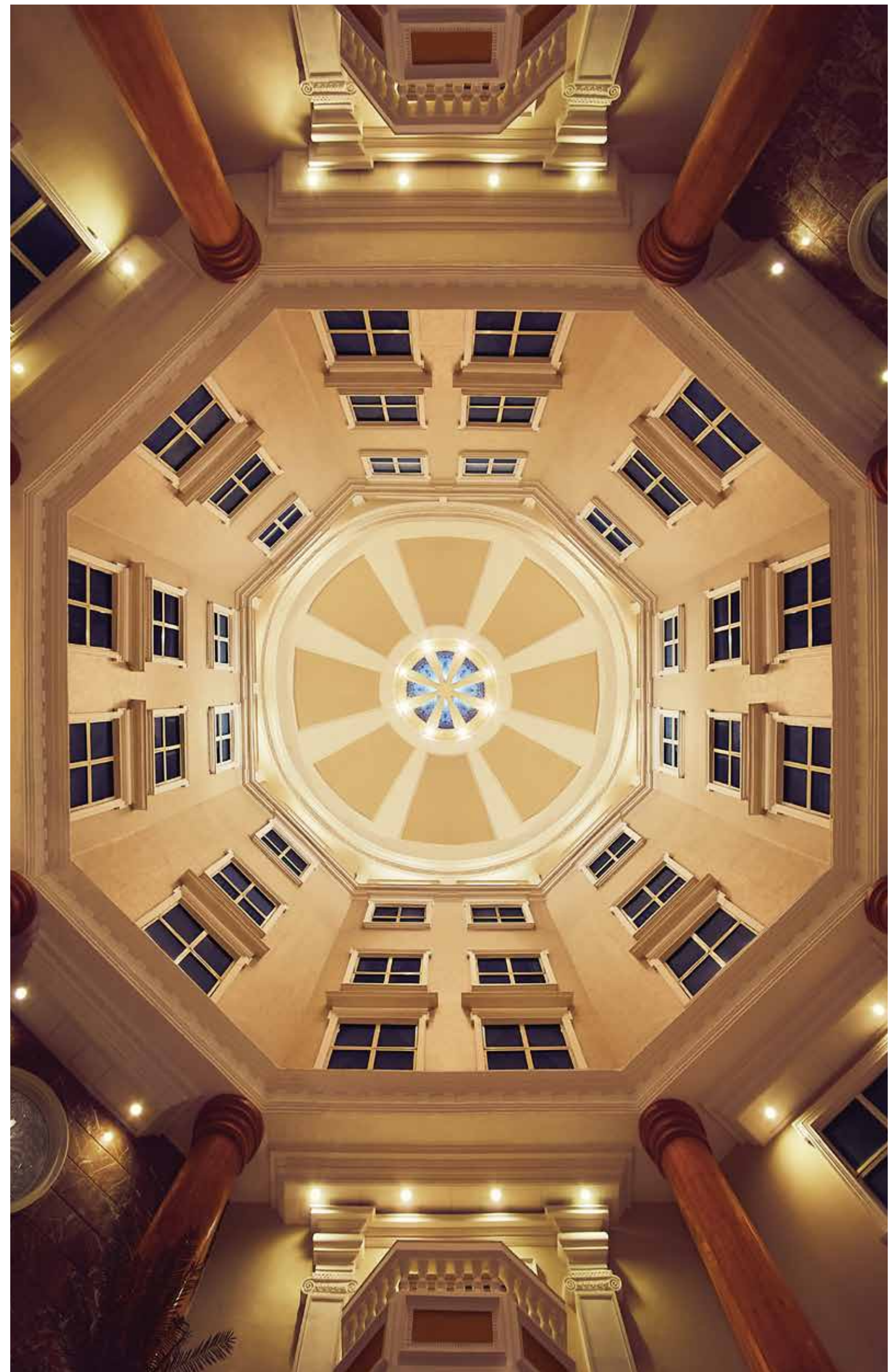
Interior image of Olympia, Hiranandani Gardens, Powai.

Every Hiranandani township reflects this commitment to raising a complete world that looks into all aspects of living. Diverse ventures come together to create an integrated experience, minutely balancing all areas of happiness. An eco-friendly ambience, convenient infrastructure, luxurious lifestyle and proximity to work are seamlessly incorporated together, adding depth and joy to daily life.